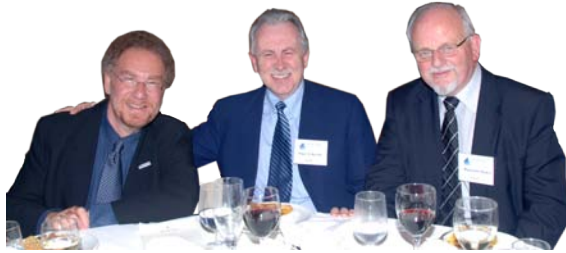
Vancouver CHILD investigator meeting May 4-6, 2008.