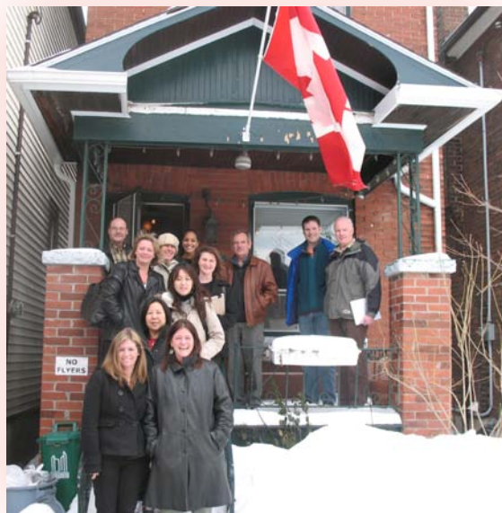
First home inspection training session, on-site visit, Toronto, March 10, 2008.